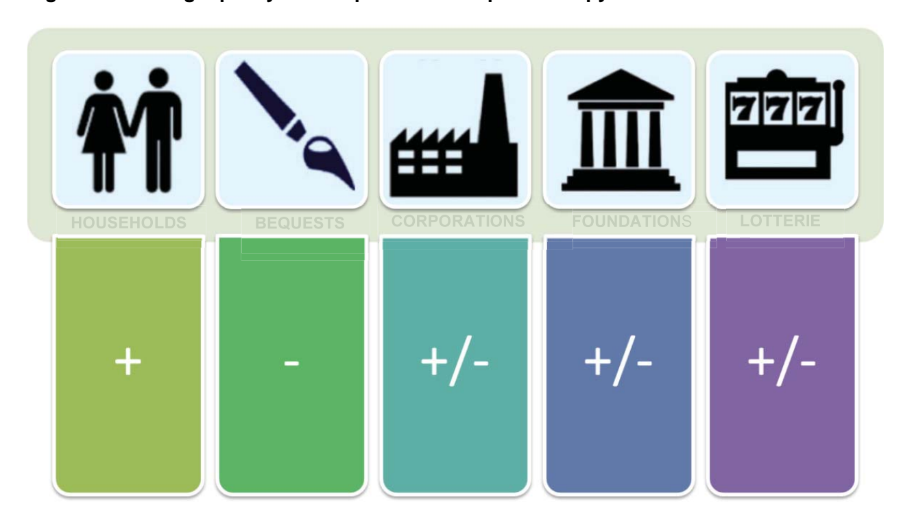
Figure 3.2 Average quality of data per source of philanthropy

enough, there are few countries that provide representative, valid data on giving by corporations, neither categorisations regarding their supported goals nor background information about the donating companies. The same also goes for giving by foundations, which we have only an incomplete picture of in most European countries. This gap in information should be kept in mind when interpreting the presented numbers. Considering its potential for the future, it is striking that data on bequest giving are hard to find. At the moment, there is only one European country for which we can provide an estimate of the total amount of bequests to charitable goals, Switzerland. In 2007, the Swiss donated EUR 660 million through bequests; a considerable amount, especially when compared to the total amount that Swiss households donate to charitable goals (EUR 1 381 million). So, on the other hand, the current gaps may also turn out to be a positive surprise in the future.