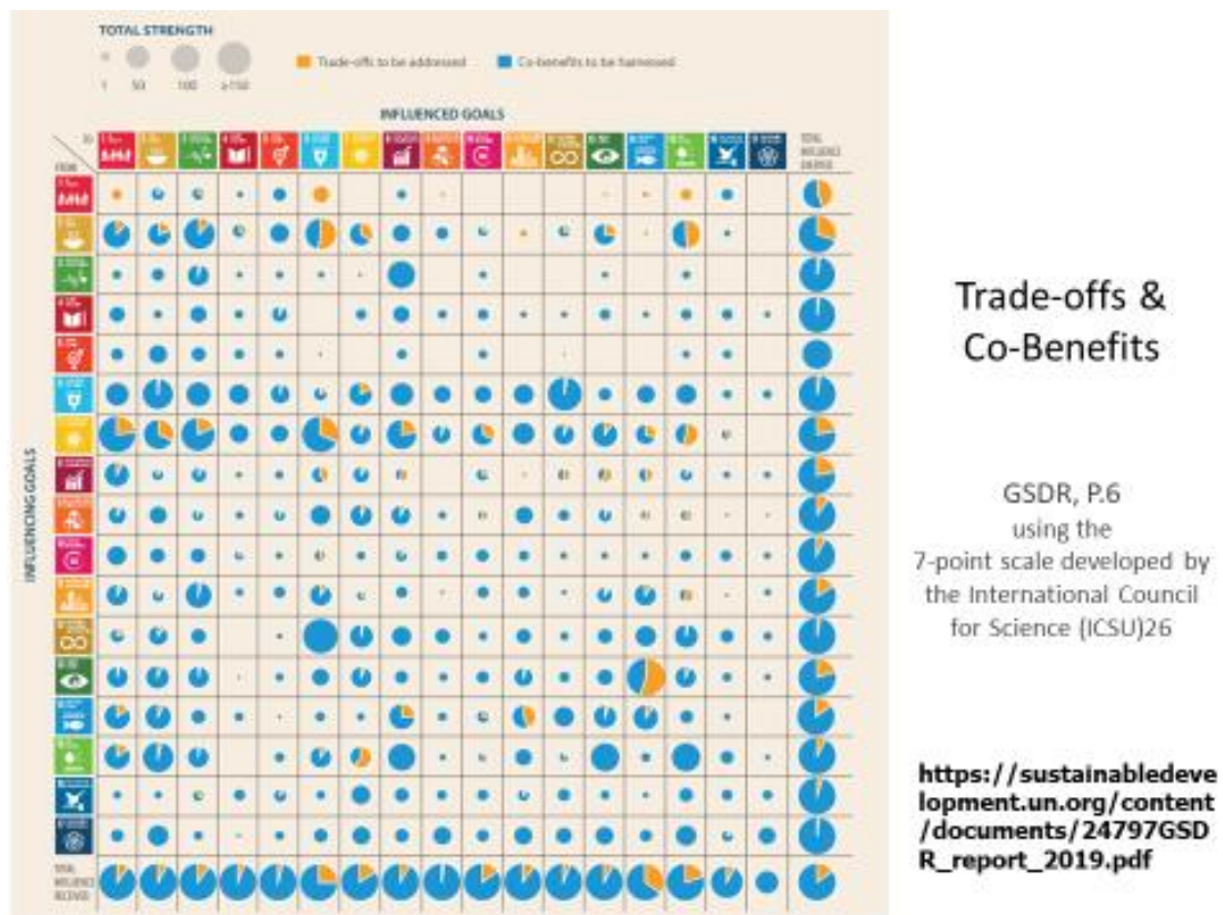
Figure 1: Global Sustainable Development Report, 2019, p.6 17

POs decision in which of the 17 goals to invest in developing county X and on which of the 169 targets to concentrate their efforts on needs to be analyzed in regard to possible trade-off or synergistic impact their investment might have on other goals and targets. This is not a merely academic exercise but is in fact of high political importance. Should for instance a PO's capacity building projects could result in strong trade-offs, the PO needs then to talk to the diverse interest and stakeholder groups and seek for amicable solution that are acceptable to the key stakeholder. Such common ground will better ensure the sustainability and effectiveness of the investment.