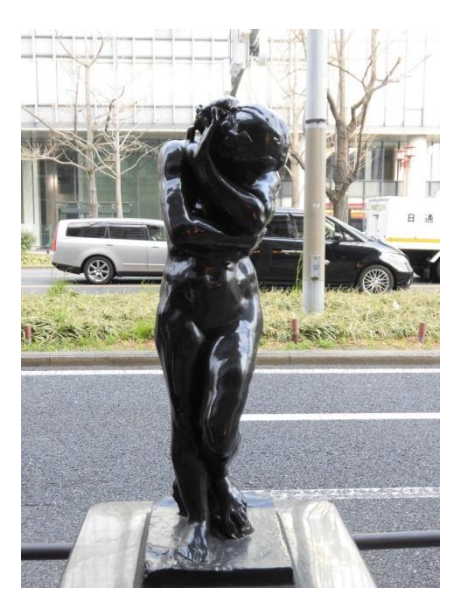
Figure 3 A sculpture at Midosuji street, "Eve", Auguste Rodin

Capital city of philanthropy plan is treated as one of four main policies. The Vision of Osaka Vice-Capital City Plan was issued in March 2017.