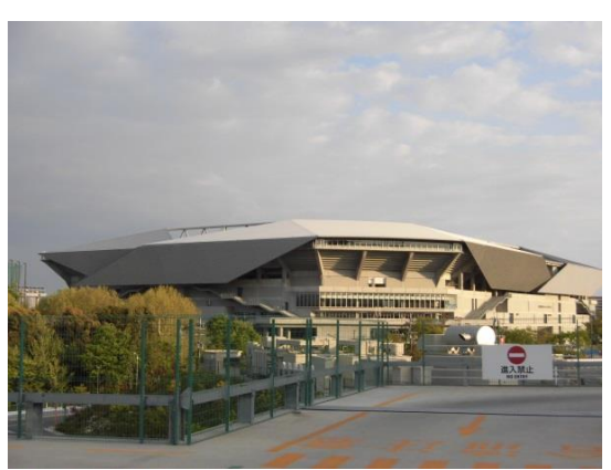
Figure 2 Suita City Football Stadium